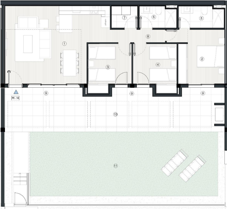
PLANTA BAJA CON JARDÍN