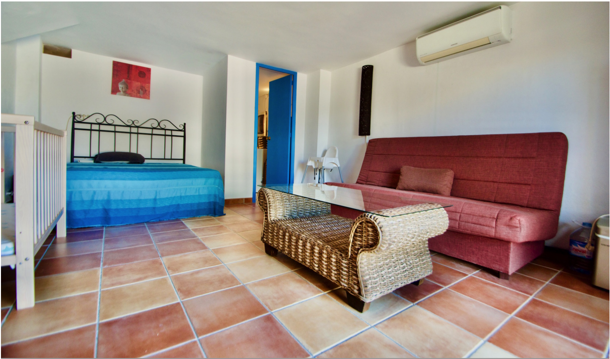
Image not found https://www.cmsinmo.com/imagenes/uploads/inmu/4/10351/https://www.europasol.com/objetos/temp/source/europasol/europasol-propiedades_634