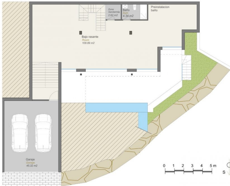
PLANTA BAJO RASANTE BASEMENT FLOOR