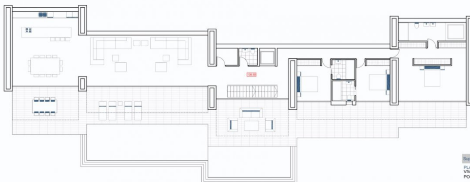
PLANTA ALTA (