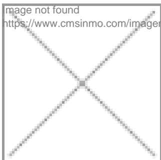
image not found https://www.cmsinmo.com/imagenes/uploads/inmu/4/6218/http://orangevillas.com/media/images/p